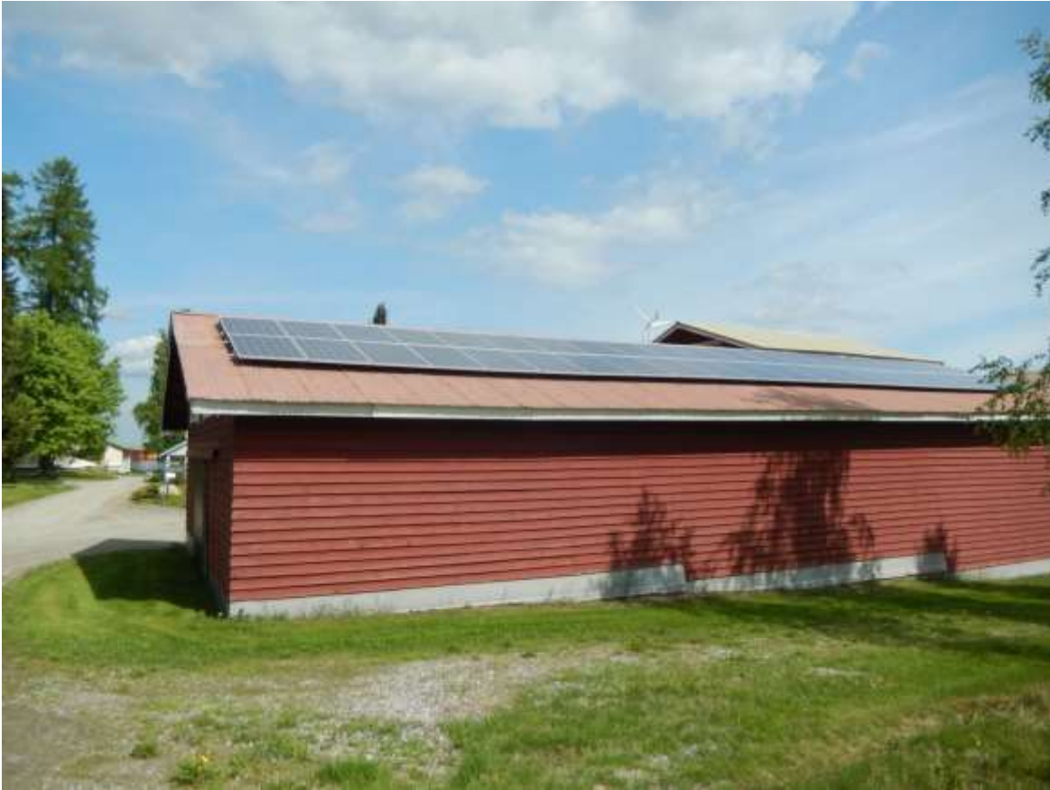
Figure 1. Energy overview of Itikan tila by E-farm 2 Karelia university of Applied Sciences

Two years ago, the Itika farm invested into a solar photovoltaic (PV) plant with a capacity of 10 kW. The investment level was at 14 000 Euros plus value-added tax (VAT). The implemented technology is German, SMA Solar technology AG, with the Finnish reseller Oulun Energia. The estimated annual production based is 8700 kWh. Within the past two years, the produced energy has been 16 000 kWh with the main production starting in March. The energy produced is directly distributed to the grid through an inverter system. The estimated payback time for the solar PV system is 13 years.