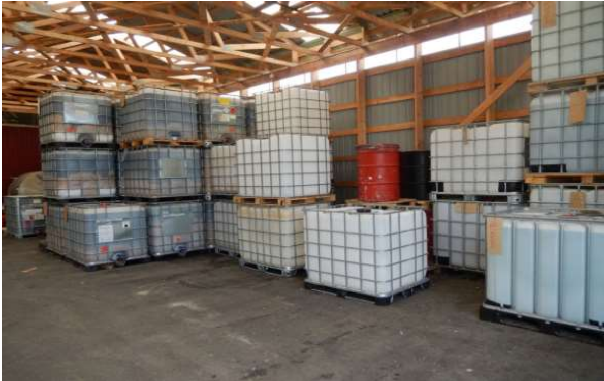
Figure 1. Energy overview of Itikan tila by E-farm 3 Karelia university of Applied Sciences

In addition to the mentioned energy production units, the Itika farm also has a production facility for briquettes. The briquette production uses straws, saw milling residues (cutter shavings and saw dust) from the local wood processing industry and residues of the seed production. The produced briquettes are being burned in the nearby municipal district heating plant in Maaninka.