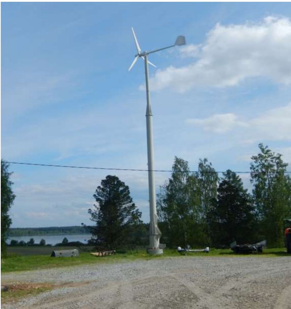
Figure 1. Energy overview of Itikan tila by E-farm 1

The wind mill 25m high with a concrete basis and a rudder system that turns the plant to the optimal direction. Advantages of this turbine are the quiet operation and the small-scale. The scale allowed for the permit to be provided by a local officer without any impact assessment. The operation time is estimated at ten years.