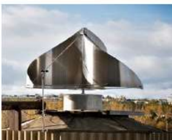
Figure 1. Evolution of IceWind 1

In 2015, the residential application was named 'CW'. The blades were redesigned for blending even better into the environment. Various colours and texture tested.