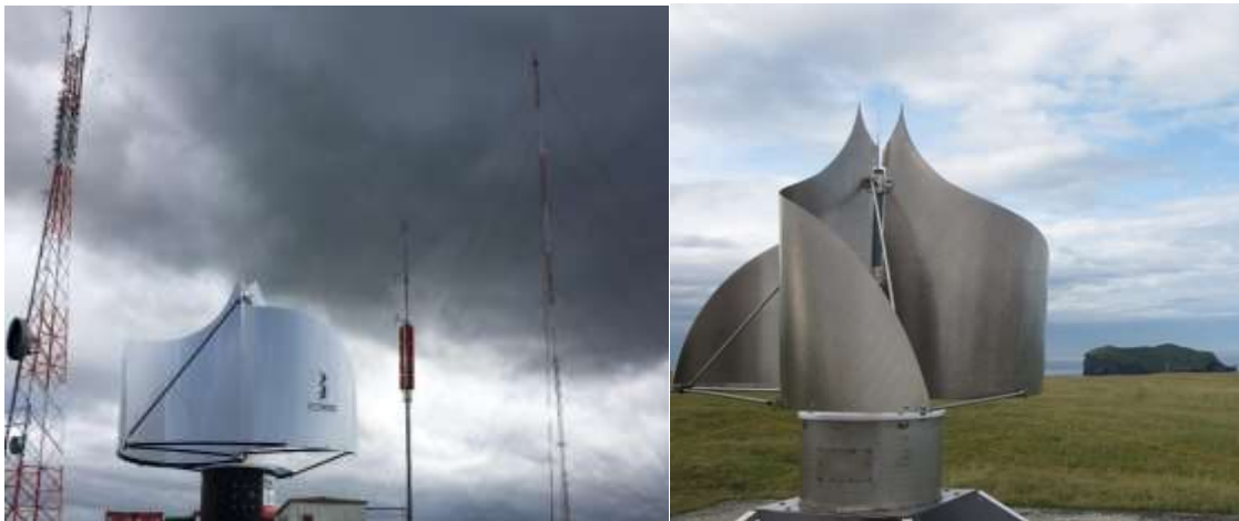
Figure 2. RW turbine and CW turbine 2

The turbines split into two categories. The RW for Telecom towers and CW for residential. The RW is a stackable 300W turbine and the CW is a 1000W standalone turbine.